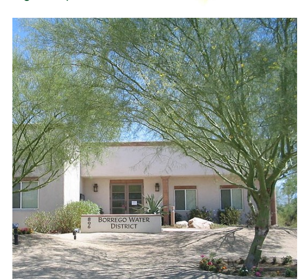
The Borrego Water District - Desert, flowers, and water.

The Borrego Valley (Valley) became a farming community after the turn of the Cattle grazing and row crops century. began to appear where the water was easy to access. With the invention of the water pump and water well drilling, the area began to flourish with larger farming operations and agriculture. Agricultural uses including citrus groves and palm tree farm uses, currently comprise an estimated 70% of total water use in the Valley which is much larger than the Borrego WD service Today, the largest feature of the Valley and surrounding area is the 600,000 acre, world renowned Anza Borrego State Park of which the community of Borrego Springs is the hospitality hub. About 2,000 people call Borrego home full-time and another 3,000 to 4,000 come there for the winter season from areas around the world.