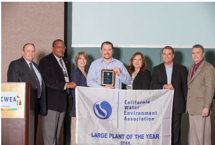
Encina Wastewater Authority—California Water Environmental Association's Large Plant of the Year 2015.

Efficiency and Fiscal Responsibility. EWA is committed to continuously increasing efficiency and operating in a fiscally responsible manner, and regularly reports on efficiency activities and improvements. This commitment includes: effectively maintaining assets; conducting long-range planning to ensure appropriate investment; implementing cost-effective resource recovery programs; and developing additional revenue sources for the agency. EWA's commitment to efficiency is complemented by strong internal financial controls, which are designed to meet the financial and budgeting needs of member agencies, comply with governmental accounting standards, maintain appropriate financial reserves, and ensure fair and equitable allocation of costs. These standards for efficiency and finance mean that EWA is a cost-effective supplier of services and value.